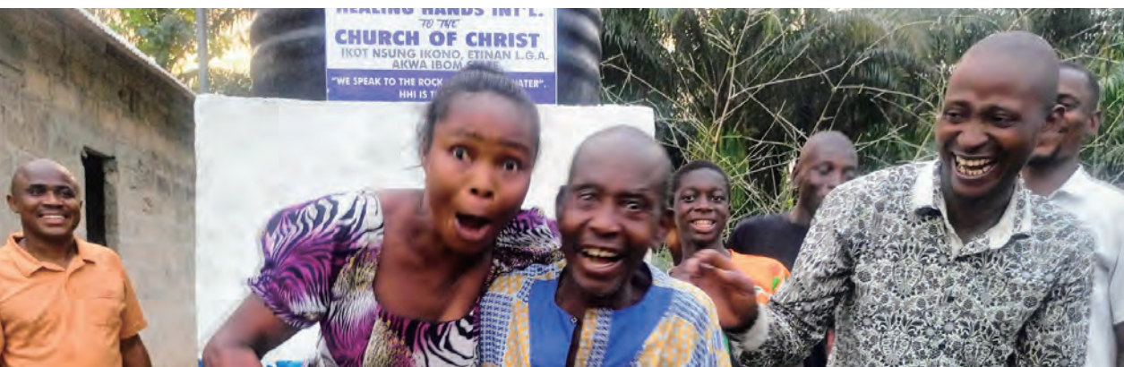
IKOT NSUNG IKONO, NIGERIA