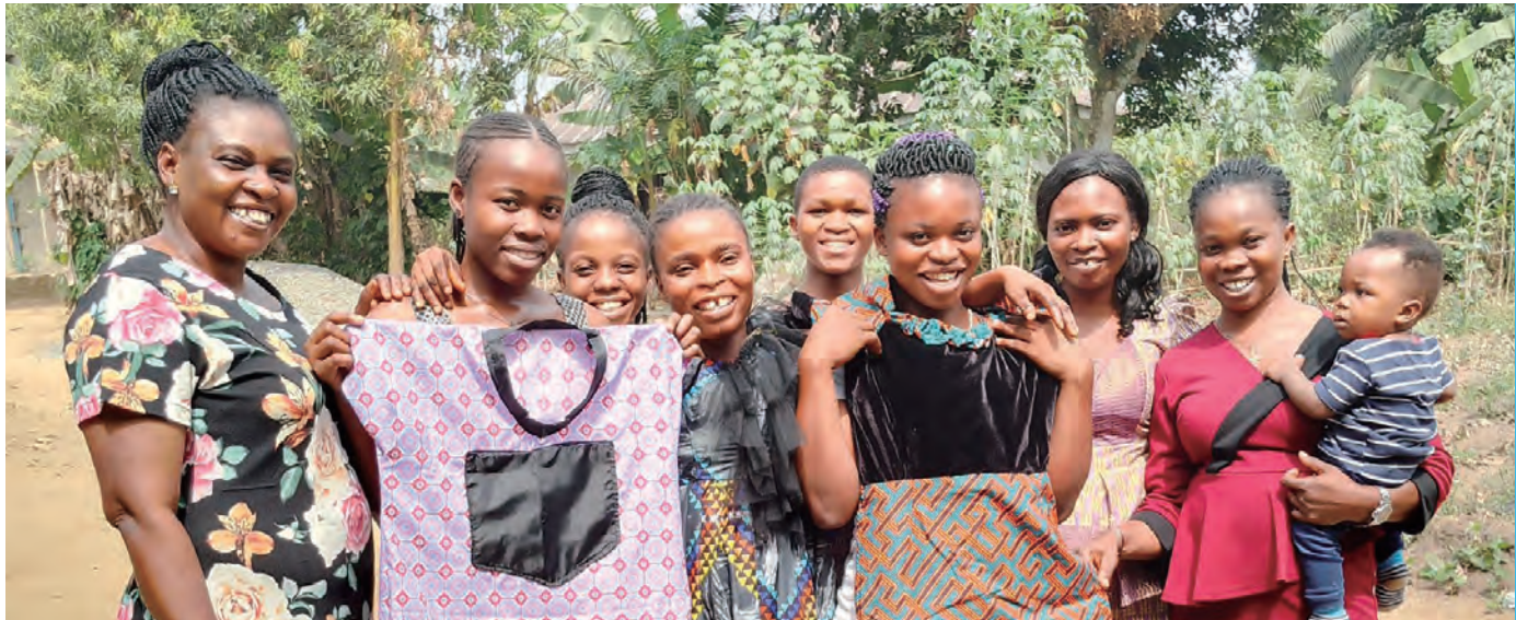
OKU ABAK, NIGERIA

Life changes at the well. Whether it is a well of water or the Wellspring of Life in Jesus Christ, new beginnings are born at the well. As Christians, we understand that God will convene with us wherever we are. We need not be perfect in deed, faith or profession to call on our Lord, even through all the uncertainties of our humanity.